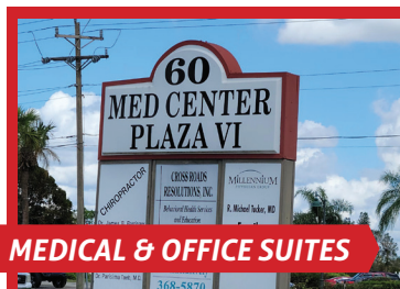
MEDICAL & OFFICE SUITES