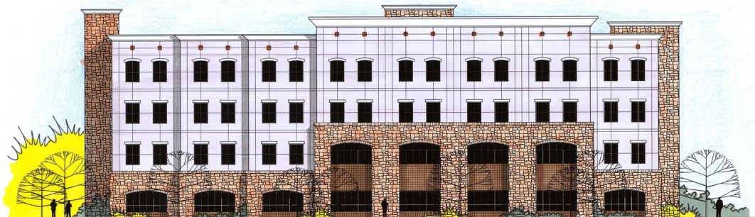
Office Building - Lee Boulevard Elevation