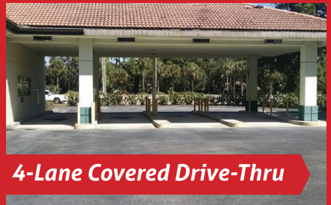
4-Lane Covered Drive-Thru